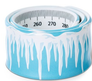
Icicle slap band Ruler

The Scented Stackable Highlighters and Snowy Origami Set from term 1 are also still available.